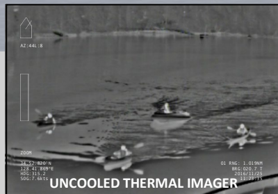
UNCOOLED THERMAL IMAGER