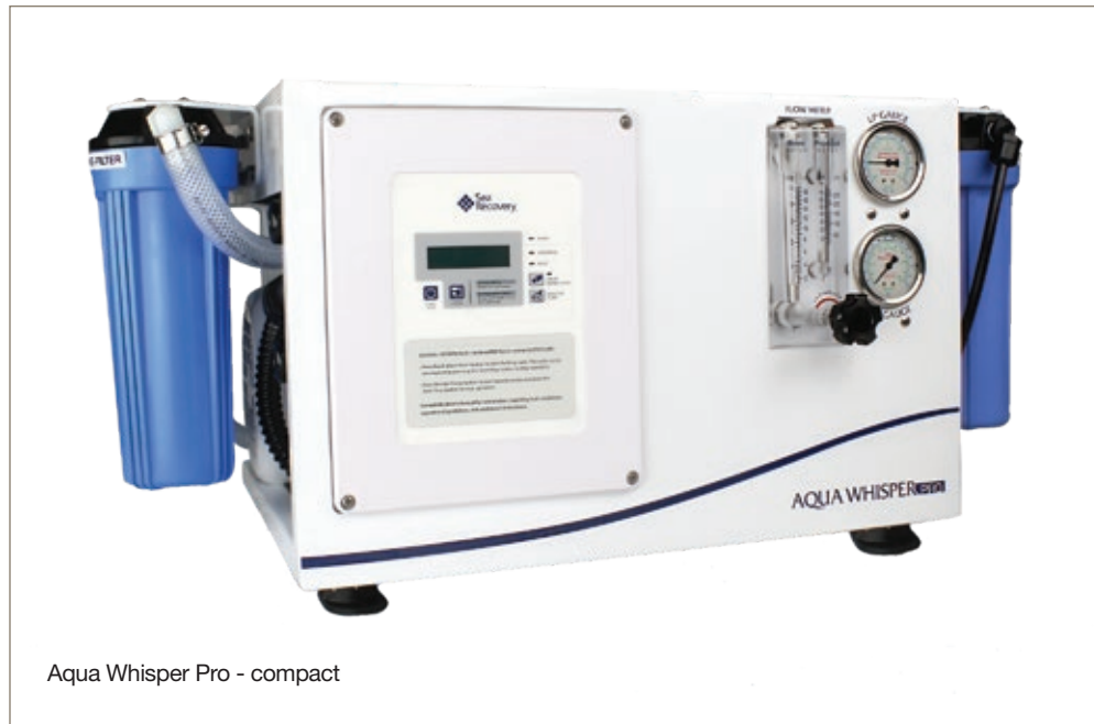
Aqua Whisper Pro - compact

The Aqua Whisper Pro watermaker is suited for charter, offshore fishing, and ocean cruising. Its traditional manual functions and touch-pad control panel allows simple operation and digital + analog instrumentation for redundancy. The Aqua Whisper Pro's high pressure pump is engineered to be quieter than conventional high pressure pumps, and operates for 2,500 hours before any maintenance is required.