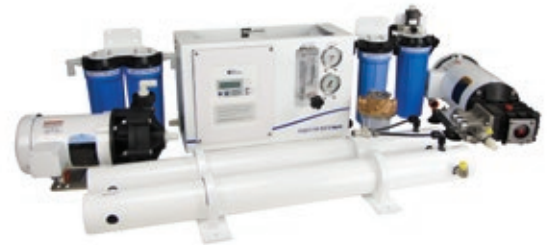
Aqua Whisper Pro - modular