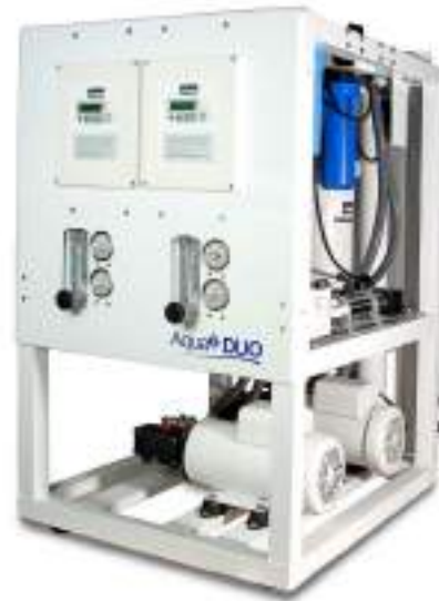
Aqua 2 Duo Mega Yacht Series

Designed for higher capacity, more efficiency, and quieter operation. This system includes state-of-the-art features that are ideal for mega-yachts, commercial fishing vessels, work boats, charter boats, and private residences.